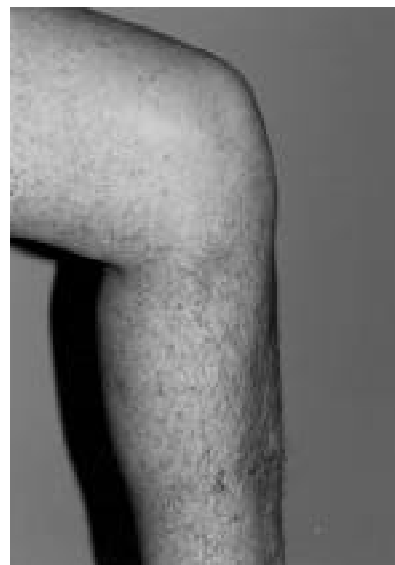
Fig. 1. Bilateral asymmetrical purpuric lesions on the lower extremities; some were palpable.

marked improvement in the purpuric symptoms. After 6 weeks the dose of prednisolone was reduced to 60 mg once every week.