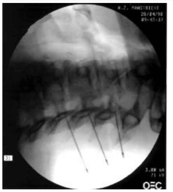
Fig. 1 . Diagnostic nerve block of the medial branches of the dorsal rami C3, C4 and C5. The needles are positioned at the base of the superior articular processes and make contact with the bone. C-arm in the 20°- 30° oblique and 10° caudocranial projections.

The zygapophyseal joints are innervated by the medial branches of the dorsal rami of the segmental nerves (29, 30). Each zygapophyseal joint is ipsilaterally and bisegmentally supplied by branches from the dorsal ramus of its own segment and from one level cephalad. As a consequence, a diagnostic block of one zygapophyseal joint involves a block of the two adjacent medial branches of the dorsal rami.