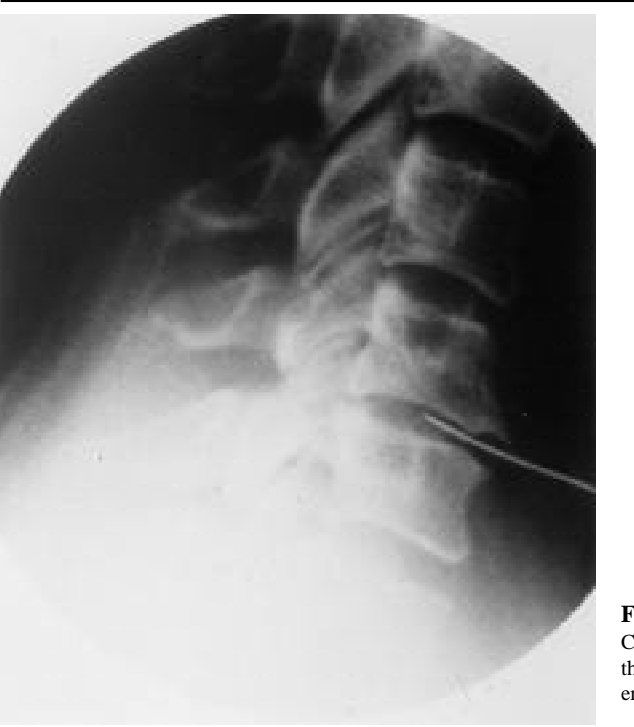
Fig. 5 . Diagnostic disc block C5-C6. Needle in the centre of the disc with the C-arm in lateral projection.

and C3-C4 is to introduce the needle from the posterior to the carotid vessels in a slightly oblique projection. The procedure is continued as described above. The posterior-lateral approach for the higher disc levels has, on occasion, been found to be technically impossible due to the presence of a large uncinate process.