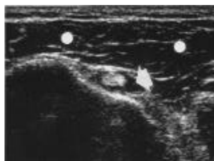
Fig. 1. Transverse scan of the long head of the biceps tendon. Evidence of hypoechoic fluid collection (→) surrounding the hyperechoic tendon. ● Deltoid muscle.