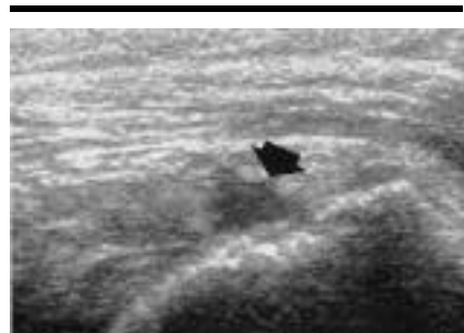
Fig. 2. Tear (→) in the supraspinatus tendon.