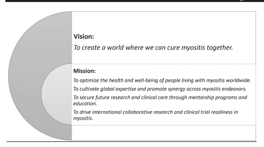
Fig. 1. The vision and mission of MIHRA.