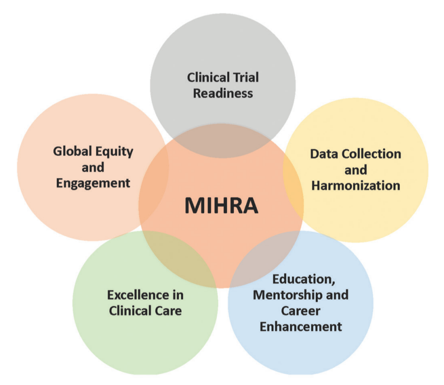
Fig. 2. Five MIHRA organisational cores.

self and that of others over urgency of production and reflects a true thinking environment for which responsible, safe expression and perceptive listening is the organisation's cultural expectation.