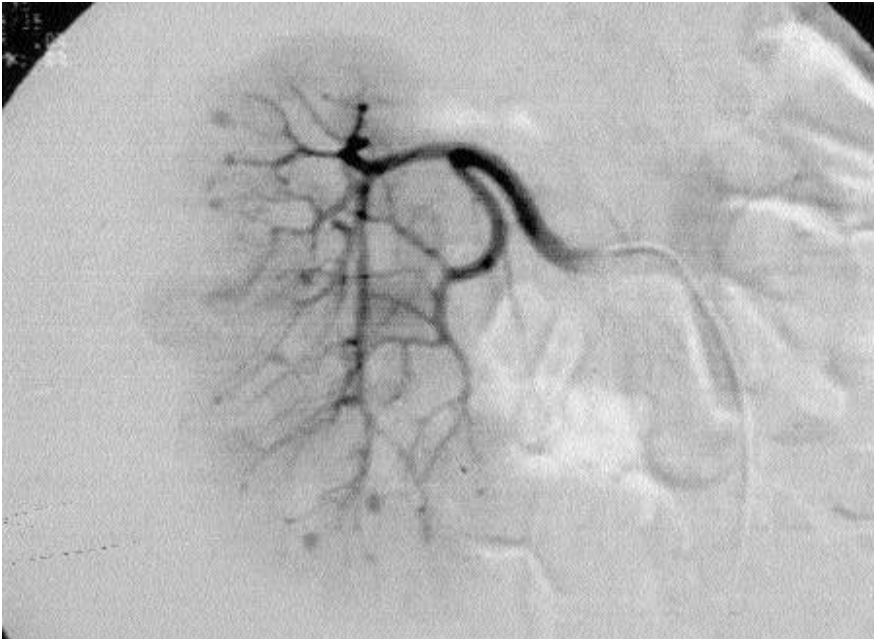
Fig. 1. Selective renal arteriography shows multiple sacciform aneurysms in the right kidney.