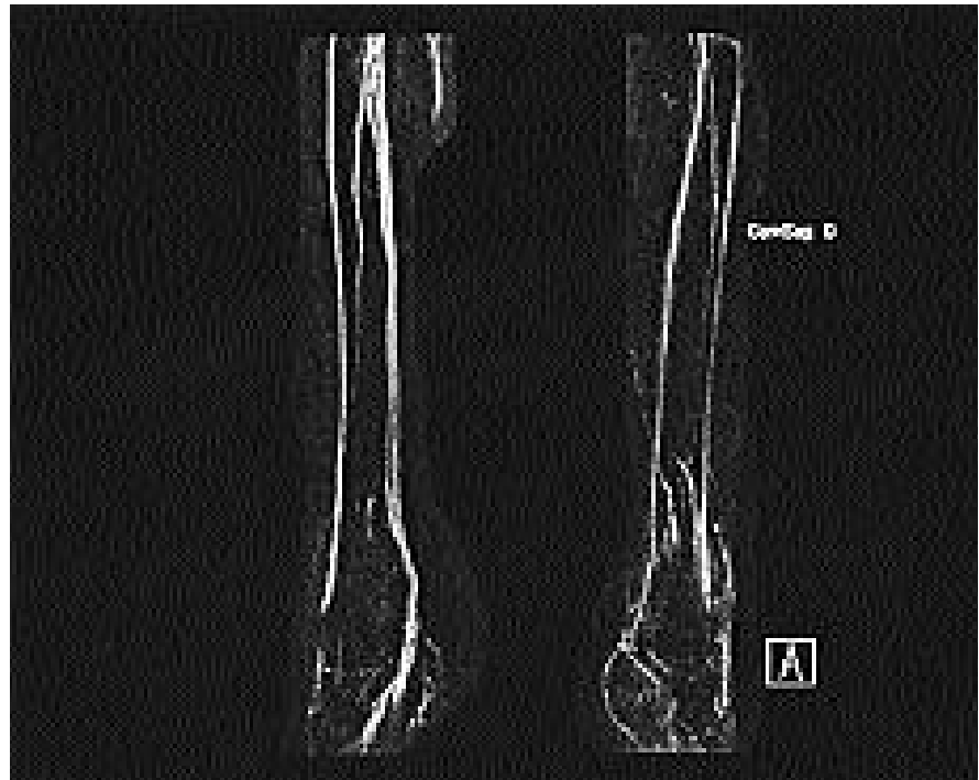
Fig. 3. Magnetic resonance angiogram demonstrating patent vessels in the distal lower limbs. The MRI/MRA of the proximal vessels was normal (not shown).

Further imaging was completed to evaluate the ischemic leg. A magnetic resonance angiogram of the lower limbs revealed the large vessels to be patent from the distal aorta to the feet (Fig. 3). Shortly thereafter developing lower extremity ischemia, the patient suffered chest pain. A non-STelevation myocardial infarction with new left bundle branch block was diagnosed. He was admitted to the coronary care unit, and received anticoagulation. A subsequent coronary angiogram did not show evidence of a focal lesion, and an echocardiogram revealed normal cardiac function. The hemoglobin dropped to 8.2 g/dL, requiring transfusion of packed red