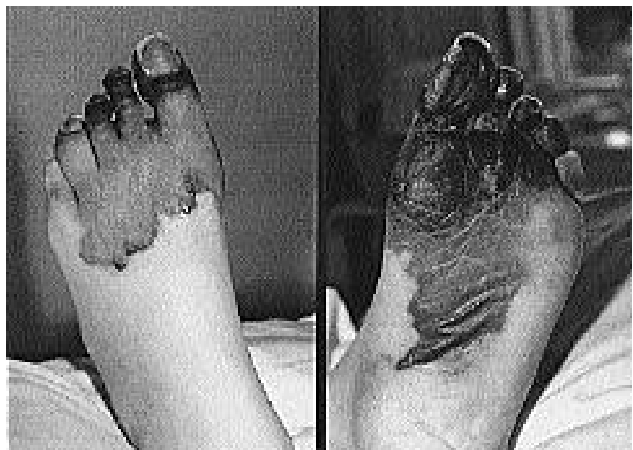
Fig. 4. Gangrene of the left foot due to vasculitic ischemia.

blood cells. Painful ischemia of the left foot evolved into dry gangrene (Fig. 4). A chemical sympathectomy was unsuccessful in providing additional pain control.