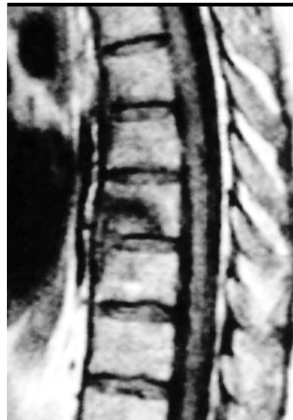
Fig. 4. A sagittal contrast-enhanced T1 weighted MR image shows the low signal of the peripheral rim.

tional radiographs of the thoracic spine showed an ill-defined, anterior hemispherical sclerotic area of the 8th thoracic vertebra adjacent to the inferior end plate accompanied by small spondylophytes, with ventral disc-space narrowing (Fig. 1). The osseous boundaries were well demarcated. Axial 2