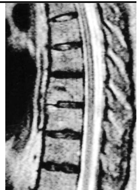
Fig. 5. A sagittal contrast-enhanced T2 weighted MR image demonstrates decreased semicircular signal within the T8 vertebral body. Anterior osteophytes of the vertebral bodies of T8 and T9 are clearly visible, with accompanying narrowing disc space.

The diagnosis was discogenic sclerosis of T8. Discogenic vertebral sclerosis must be differentiated from malignant neoplastic disease of the spine, especially in patients older than the age of