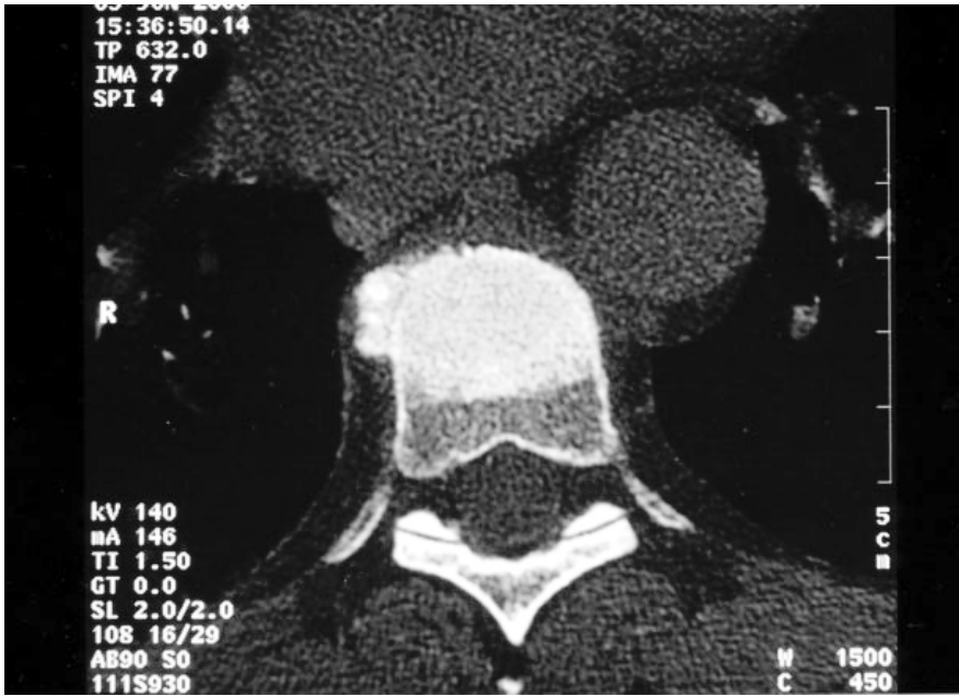
Fig. 2. Axial CT section demonstrates the sclerotic lesion of the anterior vertebral body of T8.