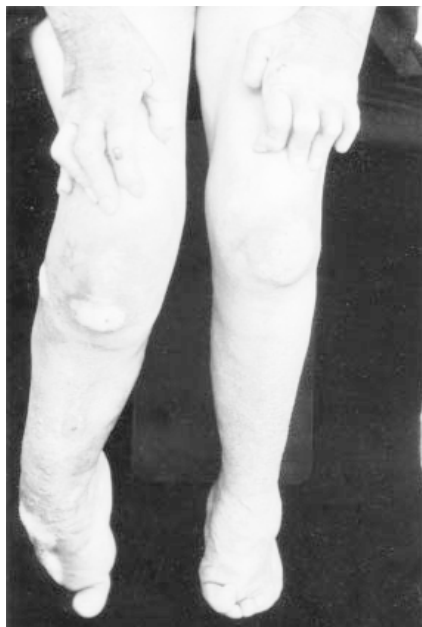
Fig. 2. Feet of patient no. 2 demonstrating cavus deformities, auto-amputation of several toes of the right foot, and psoriatic rash in both knees.

We also performed a pubmed search with no limits looking for the association of PsA and Charcot joint disease and we only found some case-reports