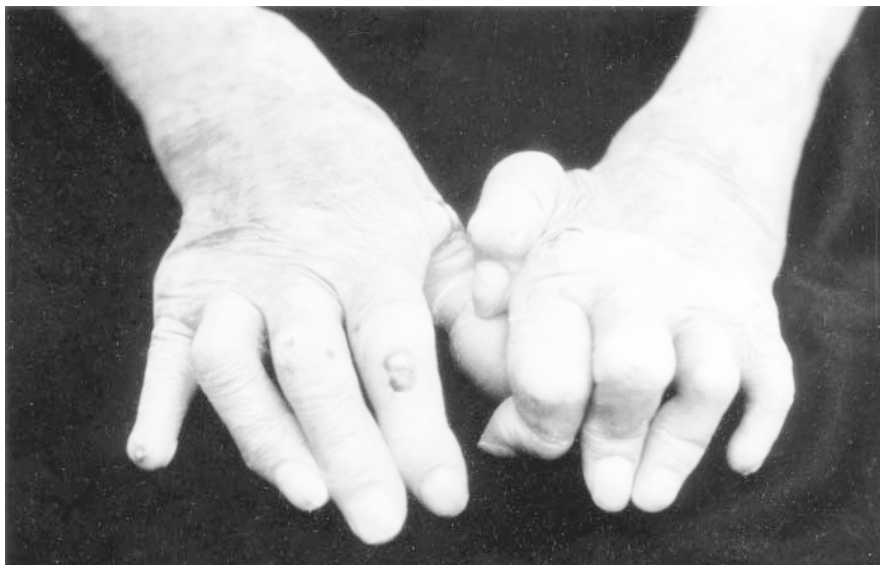
Fig. 1. Hands of patient no.2 demonstrating boutonniere deformities, and auto-amputation of the distal phalanx of the fifth digit.