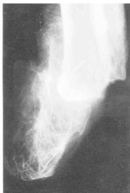
Fig. 3. Radiograph of the right foot of patient no.2 demonstrating extensive lytic destruction of the tarsal bones and involvement of the distal epiphyses of tibia and fibula.

** Treatment initiated after diagnosis of Charcot-like joint disease made.