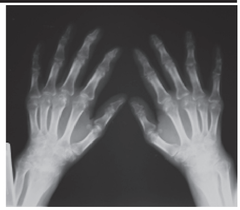
Fig. 3. A. Periarticular osteopenia, B : Joint space narrowing and erosions in Erosions and subluxations of the MTPs the MTPs and PIPs of the hands.