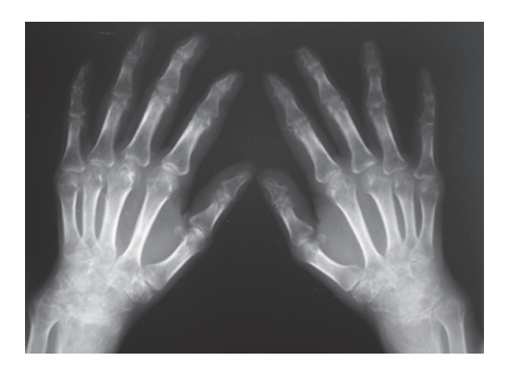
Fig. 4. Soft tissue swelling, periarticular osteopenia, joint space narrowing and erosions in the PIPs, MCPs, and destructive arthritis of the wrists.

A thirty-two-year-old female who presented with a six-year history of symmetric polyarthritis of the shoulders, wrists, MCPs, PIPs, knees, and feet, as well as Raynaud's, alopecia, generalized myalgia, diagnosed at an outside institution with undifferentiated connective tissue disease and treated with prednisone, 10 mg per day, aspirin, 100 mg per day, and nifedipine, 30 mg per day. Six months prior to presentation, she was seen urgently at another institution for an episode of thoracic pain and dry cough accompanied by dyspnea and was diagnosed with pericarditis, confirmed on echocardiogram. The prednisone dose was increased, and nonsteroidal anti-inflammatory drugs were prescribed. At the time of referral, she had photosensitivity, and a recent onset malar rash but had no other evidence of active inflammation. A presumptive diagnosis of SLE was made, and the patient was treated initially with hydroxychloroquine, 200 mg per day, and methotrexate, 7.5 mg per week. Laboratory examination revealed leukopenia and normochromic, normocytic anemia, normal urinary sediment and creatinine clearance, ANA of 1:5120 speckled pattern, and anti-DNA of 1:80. Rheumatoid factor was negative, and complements C3 and C4 were normal, as were anticardiolipin antibodies, IgG and IgM, anti-Ro,