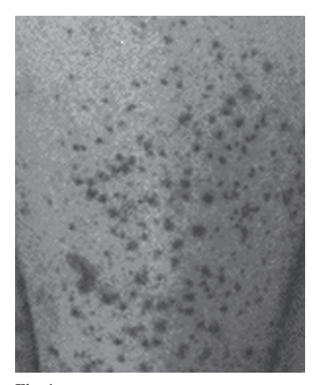
Fig. 1. Multiple purpuric papules on the thigh.

A diagnosis of SLE was based on the myocardial disease, valvular disease, hematolytic anemia, vasculitis, and erosive rheumatoid arthritis. Initial treatment was with pulse methylprednisolone and cyclophosphamide at conventional doses, resulting in clinical improvement five days after beginning therapy. The cytopenias resolved, acute-