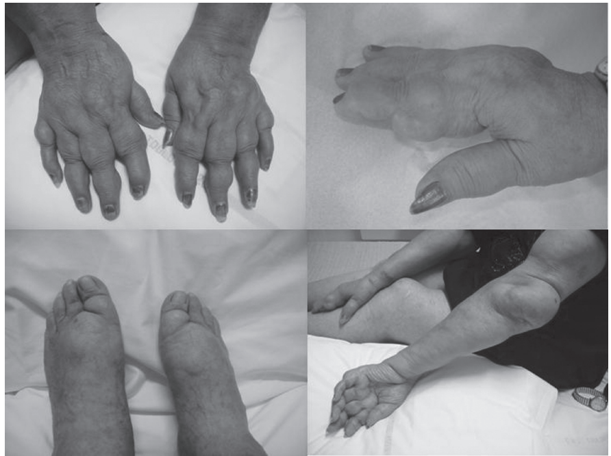
Fig. 1. Clinical aspect of hands, feet and elbows.