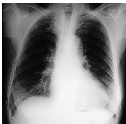
Fig. 4. Chest x-ray shows a reticular pattern.

Chest x-ray revealed a reticular pattern suggesting interstitial fibrosis (Fig. 4).