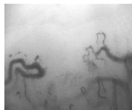
Fig. 6. Nailfold videocapillaroscopy: the pattern shows an avascular area.