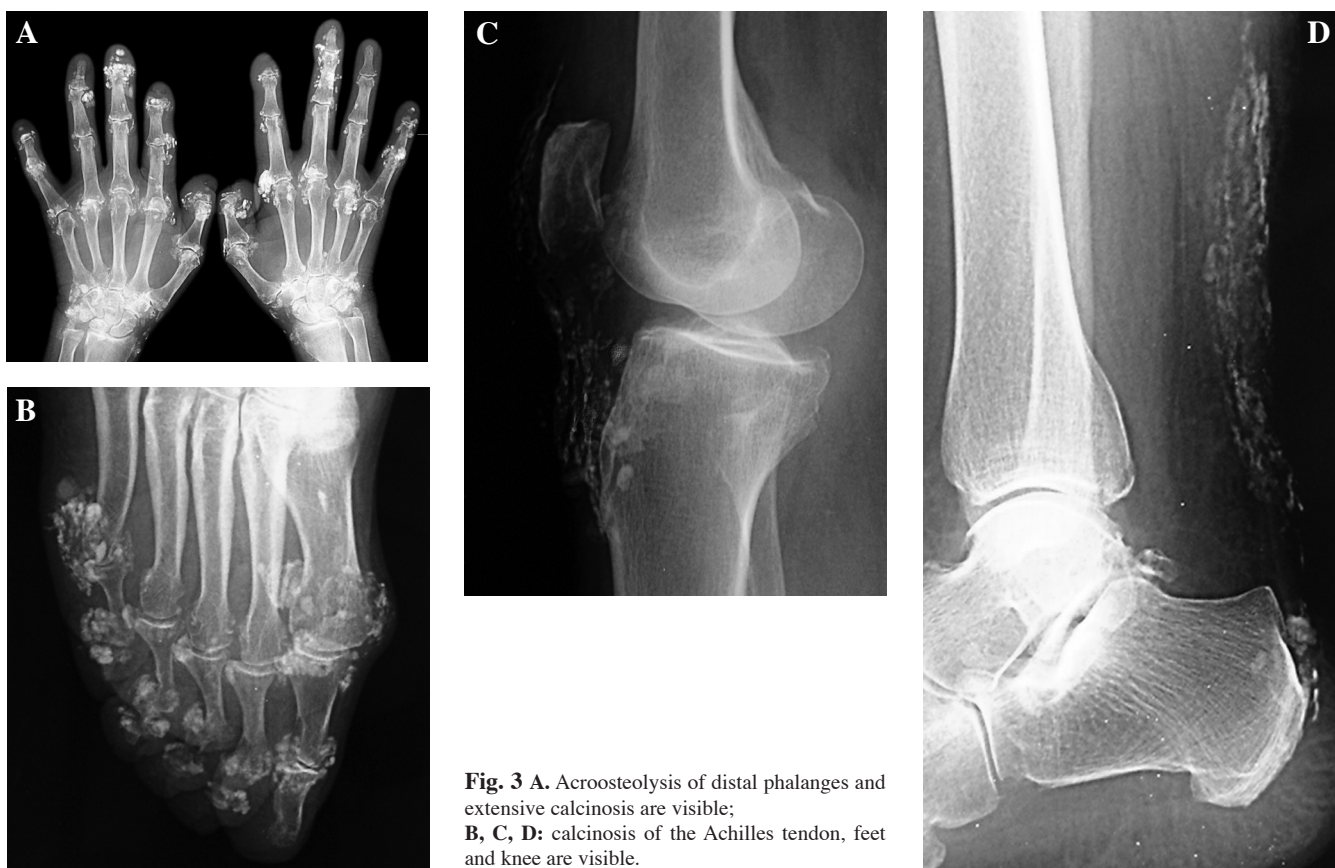
Fig. 3 A. Acroosteolysis of distal phalanges and extensive calcinosis are visible; B, C, D: calcinosis of the Achilles tendon, feet and knee are visible.

More commonly, however, acroosteolysis is observed in patients with connective tissue diseases, with special emphasis on systemic sclerosis (SSc). However, patients with systemic lupus erythematosus, mixed connective tissue disease, Sjögren's syndrome, rheumatoid and psoriatic arthritis and sarcoidosis can also present resorption of distal and proximal phalanges (9-11).