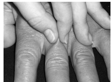
Fig. 2. The digits did not present edema or fibrosis; the skin can be pinched without any problem.