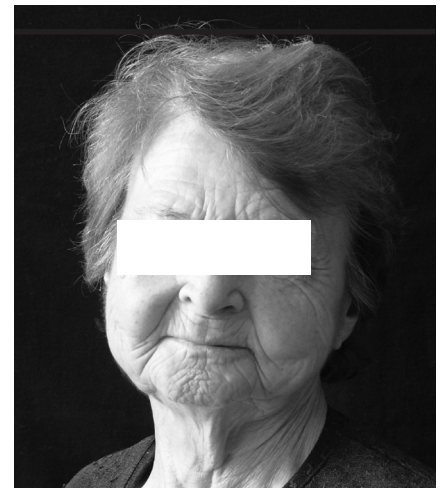
Fig. 1. Teleangiectasias are visible on the face of the patient.

It has been described in association with a variety of cutaneous diseases (psoriasis, leprosy, bullous epidermolysis, cutaneous porphiria, sífilis and pitiríasis rubra), metabolic diseases (gout, hyperparathyroidism, osteomalacia and diabetes mellitus) and neurological conditions (syringomyelia and sympathetic reflex dystrophy). Occasionally, acroosteolysis has been interpreted as a secondary manifestation to tumours, such as lung cancer, Sésary's syndrome and lymphoma (9).